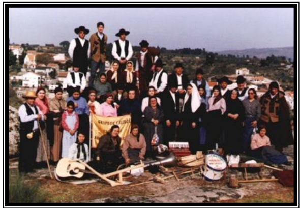
The country side of Arcozelo with a group of singers dressed in their traditional costumes