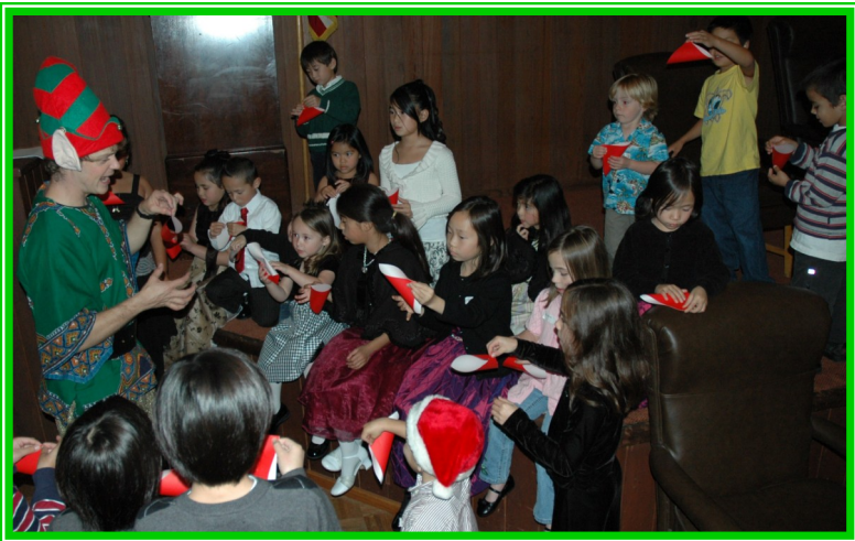
Christmas Elf entertaining the children