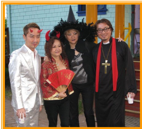
The Ferreira family from HK