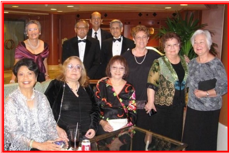
Lusitano members enjoying their 10-day Mexican Riviera Cruise on the Star Princess Oct 21-31, 2008.