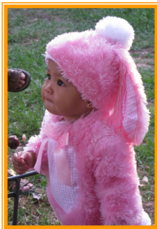
Little pink bunny, Mariah Demee