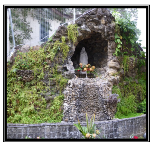
Grotto of Our Lady

Rosary Church (Mui Kwai Tong in Cantonese) was completed in May 1905 on land leased by St.Mary School run by the Order of the Daughters of Canossa.