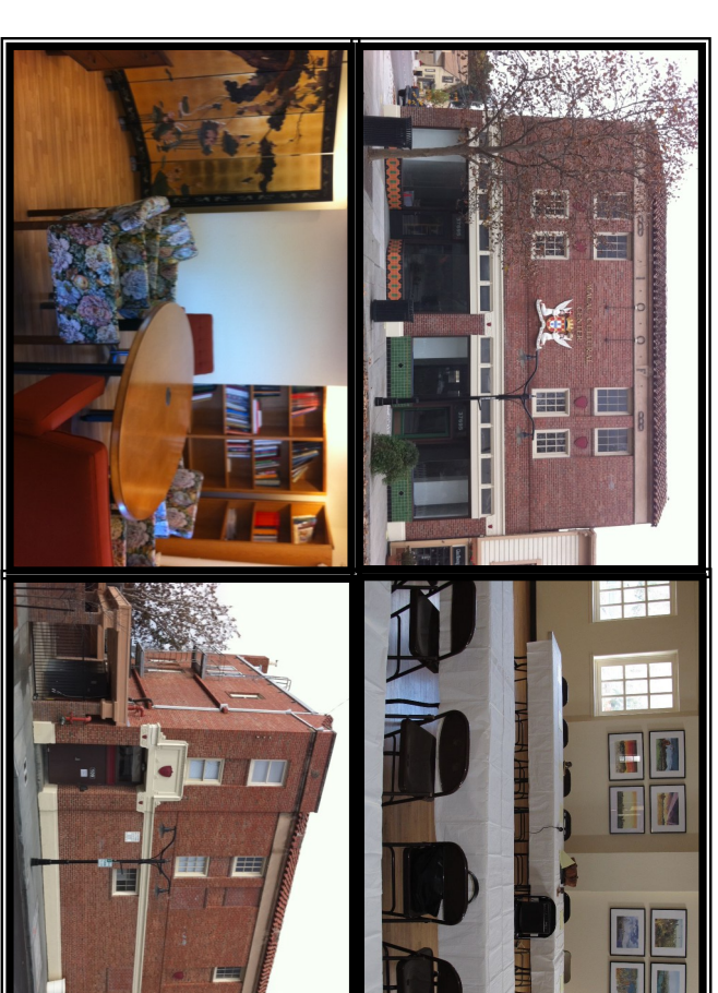
Macau Cultural Center: Front Façade 37695 Niles Blvd., Ballroom, Library, 109 "J" Street MCC main entrance