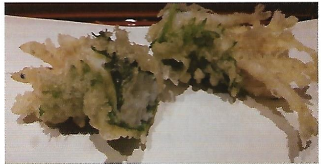
Peixe tèmpra

Both translations refer to the same cake highlighting its presentation. In addition, p'ut p'ut corresponds to the transliteration of the old Portuguese pronunciation of pan meaning bread which became pan-pan (plural of bread) in Patoá.