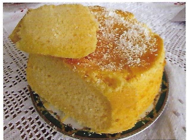
Sará-sarabe