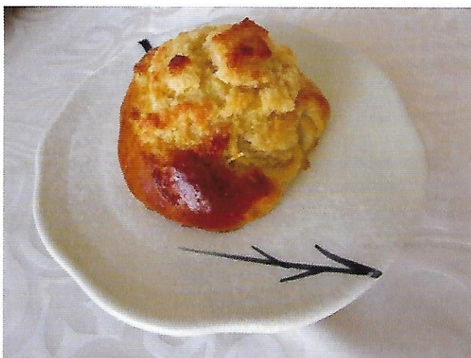
Pan pan di mamá — author's collection.

cooking with the freshest ingredients, light sauces and greatly reduced cooking time in an attempt to preserve the natural flavours of produce as much as possible thus creating more delicate dishes which require an increased emphasis on presentation. Nouvelle cuisine became famous throughout the world with the late Paul Bocuse from Lyon France.